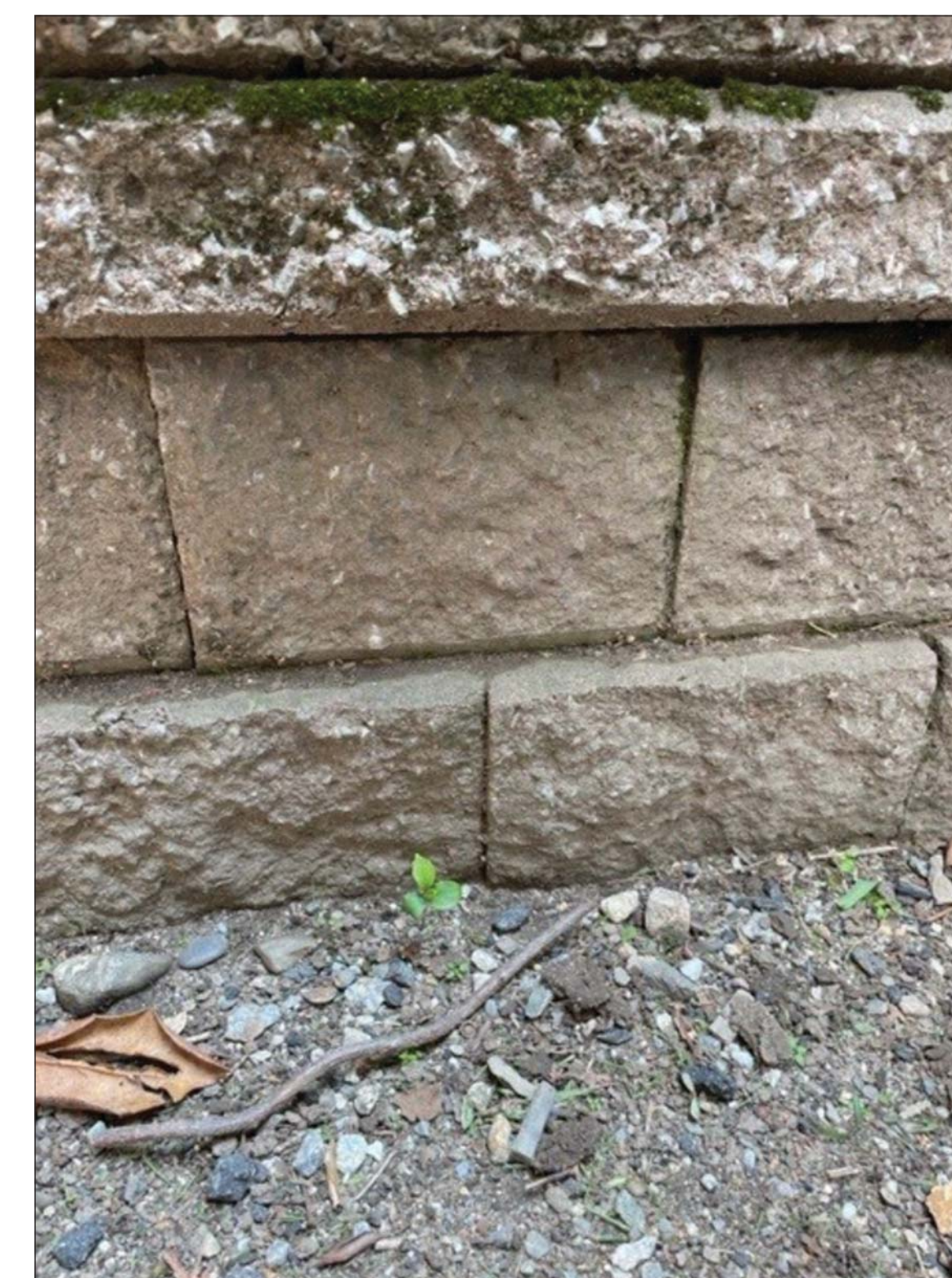
3 EXISTING RETAINING WALL